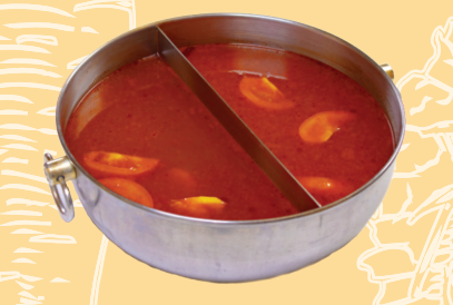
Oriental Healthy Tomato