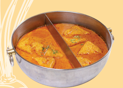
Singapore Lemak Laksa

for Friday to Sunday, PH, Special Occasions and their respective eves.