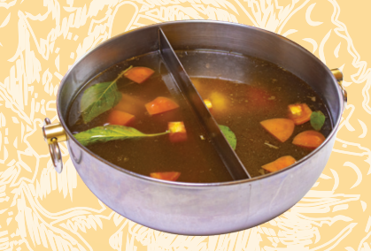
Thai Basil Chicken